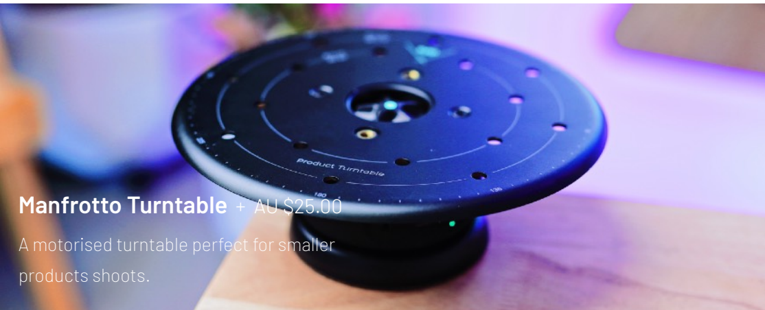
Manfrotto Turntable + AU $25.00

If you need a little extra something for your session, we have your back.