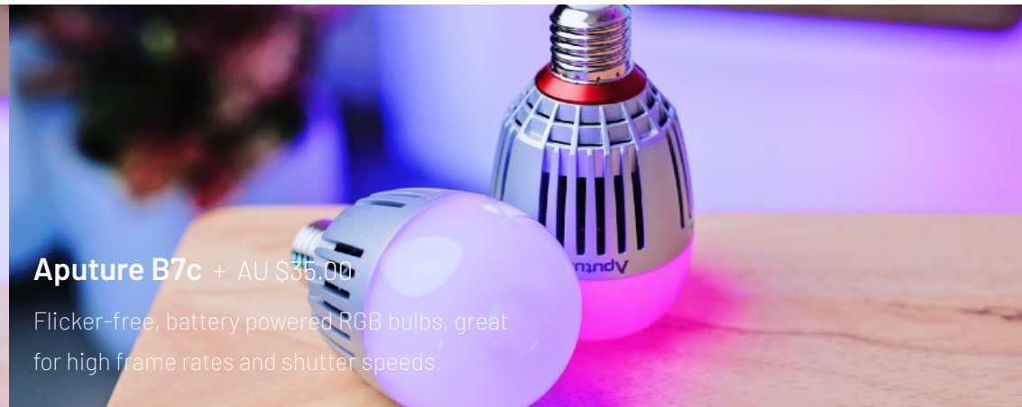
Aputure B7c + AU $35.00

A motorised turntable perfect for smaller products shoots.